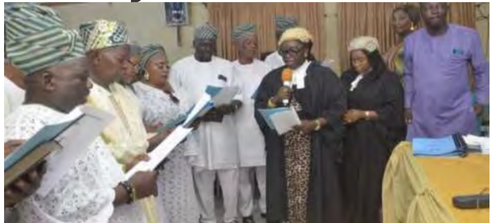
(The newly elected CDC excos of Mushin LG taking their oath of office)