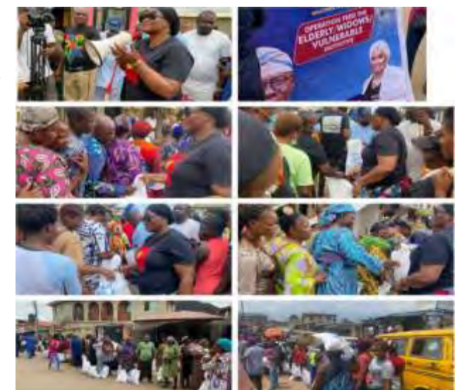
(Beneficiaries of the palliatives)

In conclusion she said "It was surprising that we could see a lot of people coming out to collect the palliative, it means they really needed it and that we approached the places it was needed, we also distributed to ward D in front of kabiesi onikosi palace, and we ensure we distributed the palliatives to them, by tomorrow we will round up with Ward F and Ward B."