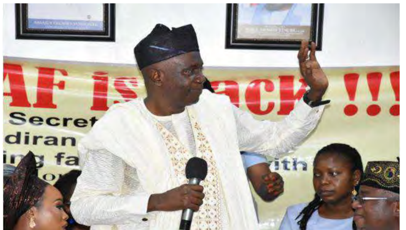
The Commissioner for Housing in Lagos State, Hon. Moruf Akinderu-Fatai, has called on management and staff of the Ministry to rededicate themselves to duty and support the current administration to actualise the THEME Plus agenda of Governor Babajide Sanwo-Olu Administration.

He also advised the technical staff to bring to the attention of the State Government any contractor found using inferior or low-quality building materials for State housing projects, saying "It is the responsibility of every worker to ensure the safety and durability of every house delivered