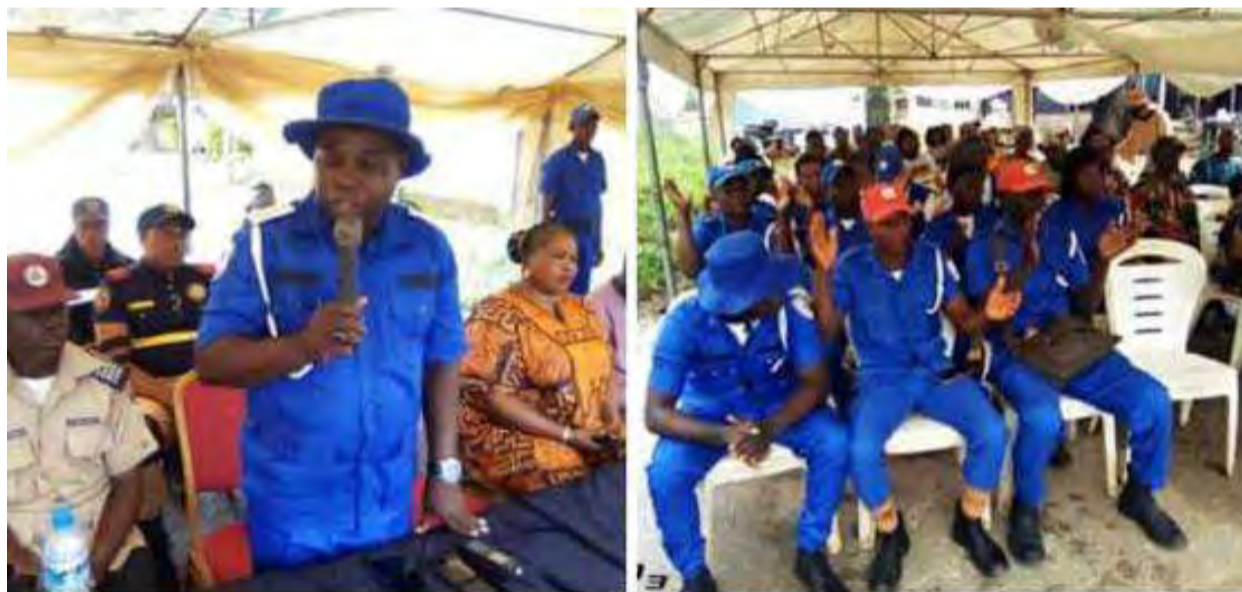
(UCS Officers marking second anniversary)

"Two years ago to be precise, after noticing the trend of events in areas like Ikorodu, Lagos Island and the rest, we came up with