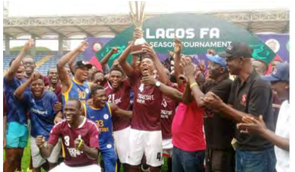
Tradesafe FC Champions of the maiden edition of the Lagos FA Preseason Cup

Tradesafe FC got N500,000 for winning the tournament with a giant trophy while Ikorodu City FC were given N100,000 for coming second with a trophy and Broad City FC got a consolatory trophy and precious handshake for coming third.