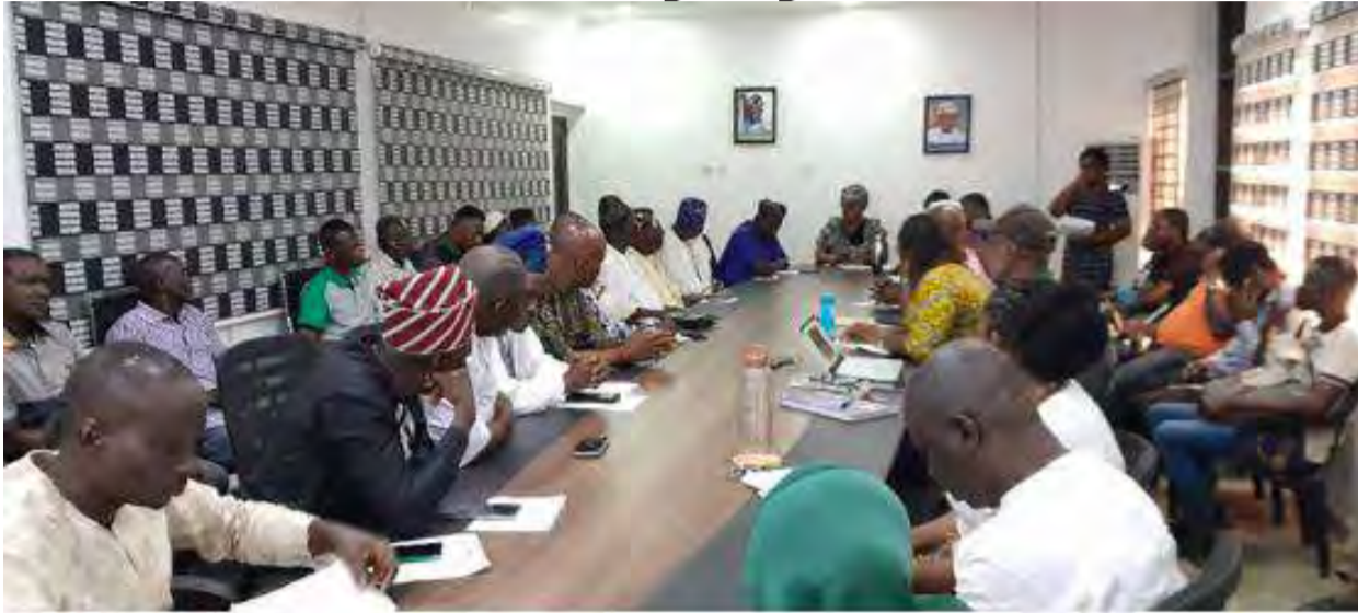
(Govt officials at a meeting with community leaders)