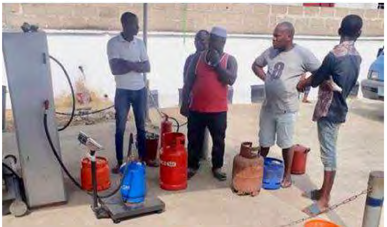
Cooking gas retailers