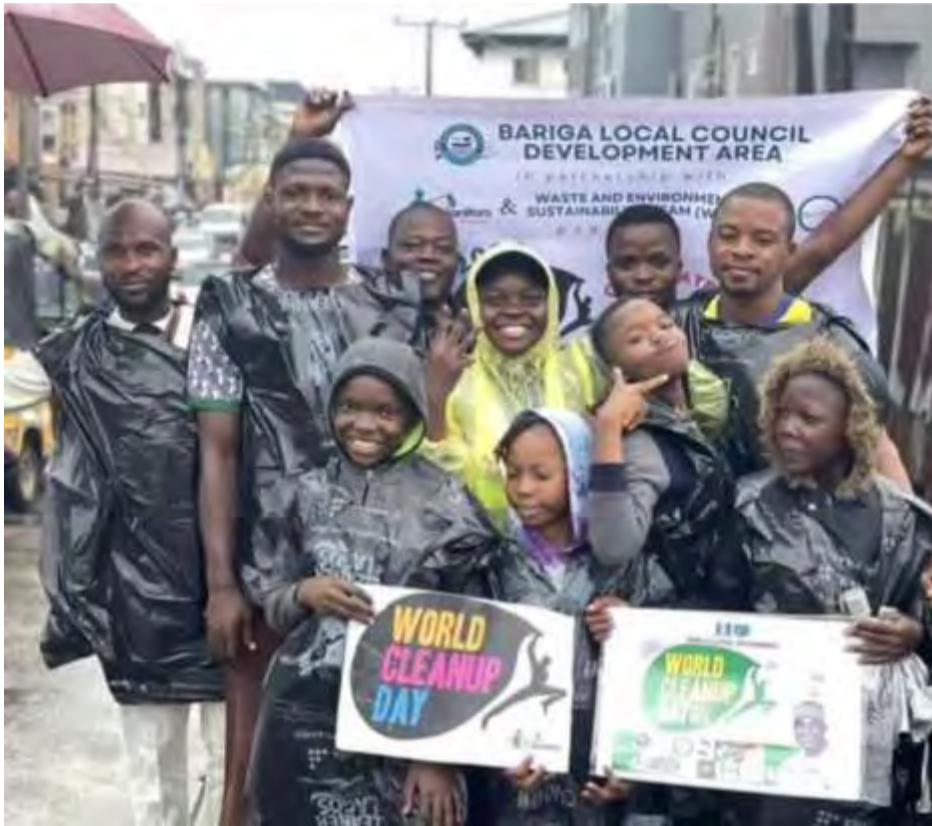
(Volunteers of an healthy environment in Somolu LG)