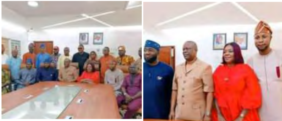
(Ifako-ijaiye's Visit to SA on works to Governor Sanwo-Olu)