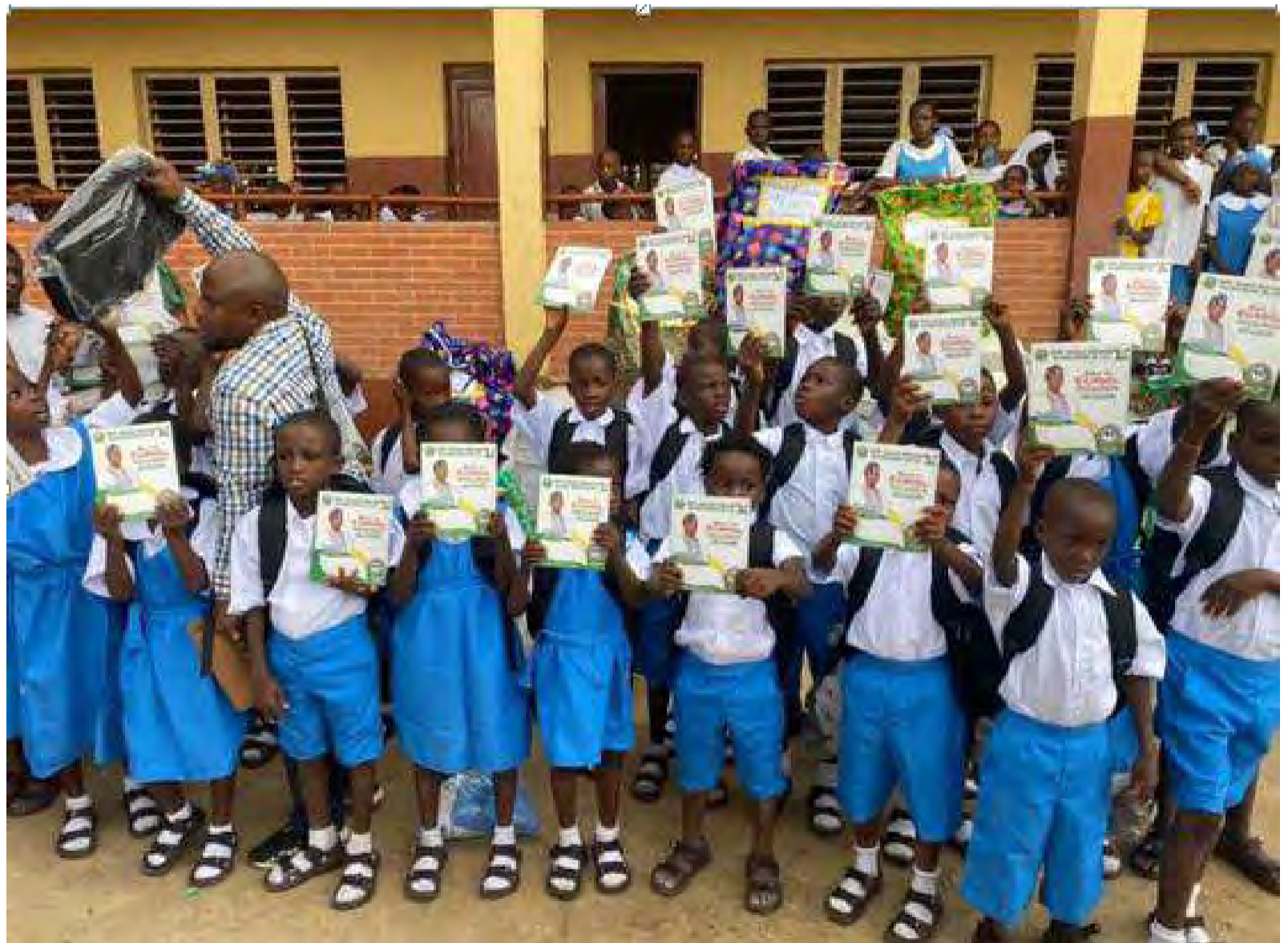
(Pupils of Coker Aguda LCDA happily displaying the learning materials donated to them by Coker Aguda LCDA)