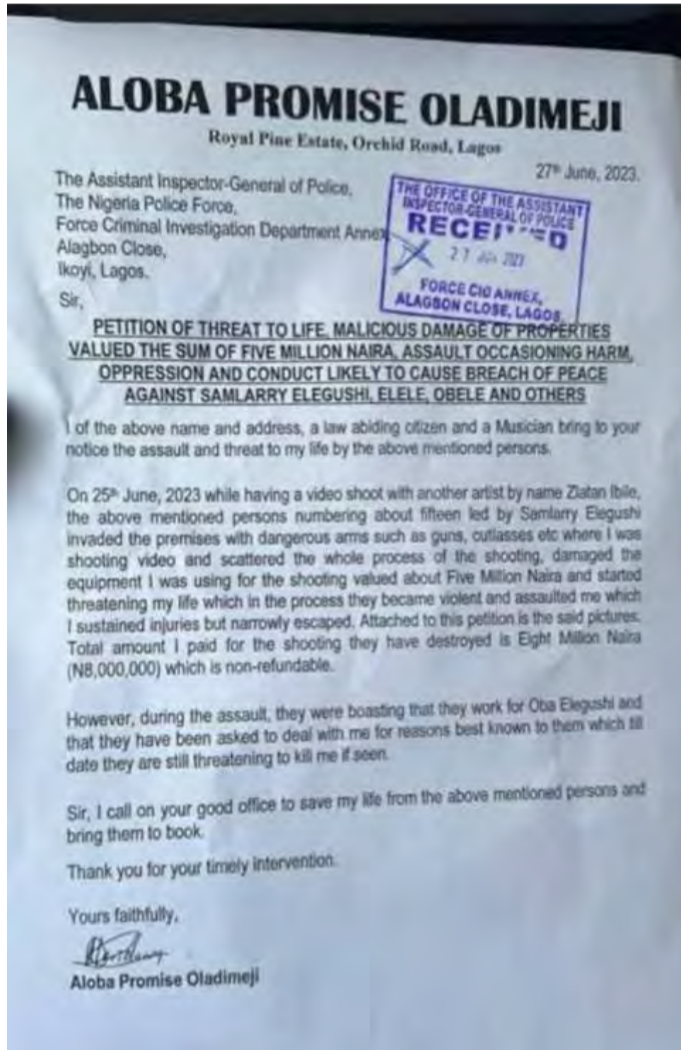
Letter to the police

The father also spoke on how he was rushed to the hospital following a phone call about the condition of his son on the day he gave up the ghost. The bereaved father narrated that on the day his son died, he got a call from his associates asking him to meet them at the hospital. According to the father, he was at the bus stop when he got another call telling him that he should return home. However, he suspected something had happened, hence, insisted on seeing his son. On getting to his son's house, he found his lifeless body with an injury on his hand and not his neck as widely claimed. When he asked the