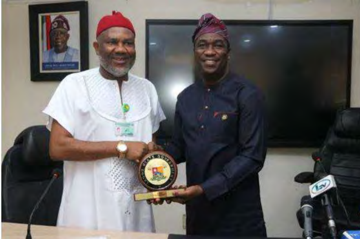
(Lagos Deputy Governor Obafemi Hamzat with the Chairman of the Federal House of Representatives, Ad Hoc Committee on Mass Transit Scheme, Hon. Afam Victor Ogame)