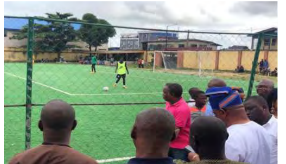
A tour of one of the sport facilities in Ajeromi Ifelodun LCDA