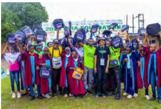
The school kids displaying the learning materials donated to them by Lira Foundation

Somolu Local Government based NGO, Lira Foundation has described its donation of school packs to students an avenue to help out parents in their roles to kids.